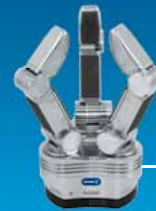
SDH servo-electric 3-Finger Gripper Hand Robot walker